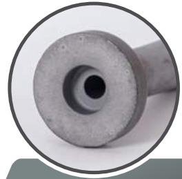
Internal Pipe Blasting Nozzles Type PTC-360°