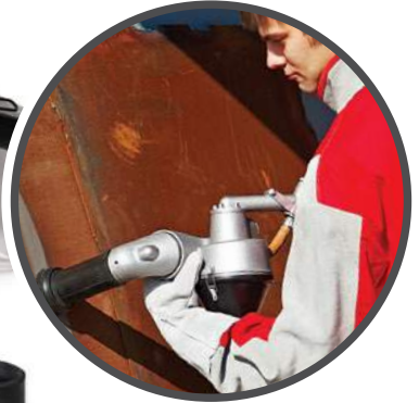
Hand-portable closed-circuit blast tool.

The Educt-O-Matic is the compact hand-portable closed-circuit blast tool, which can be transported everywhere and required just 2.5m 3 /min of air at 6bar. Blasting and media recovery are controlled just with one trigger. Media recovery is initiated by slightly pulling the trigger, while pulling the trigger fully starts the suction blast system.