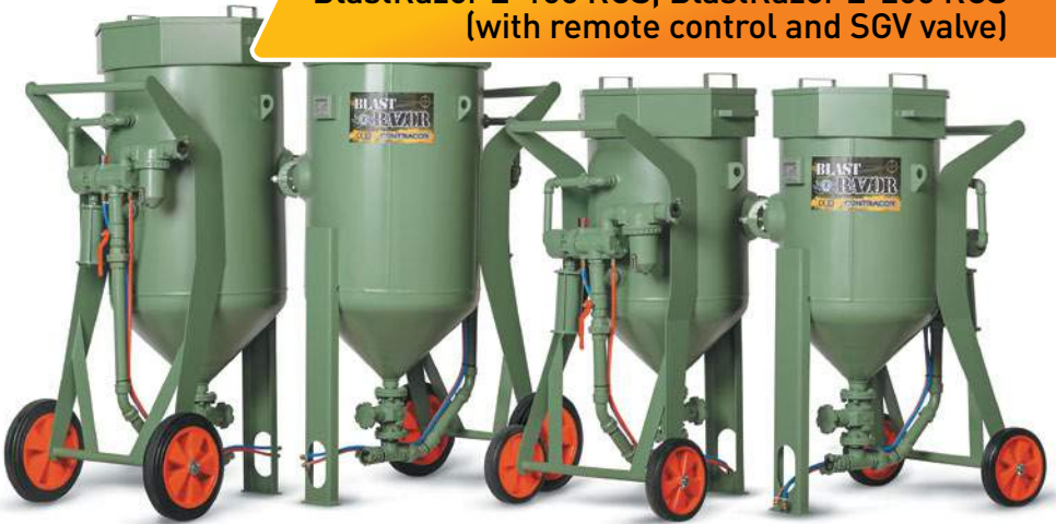
Special valve for steel abrasives SGV